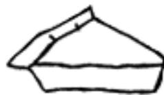
slice of pie