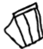
slice of cake

To return to the big picture, go to page one or click here .