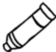
tube of toothpaste