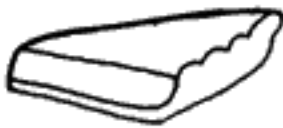
slice of pie